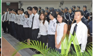
Enrolment Service 2016